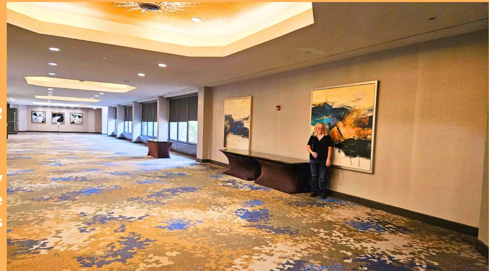
YOUR exhibitor space directly outside classrooms